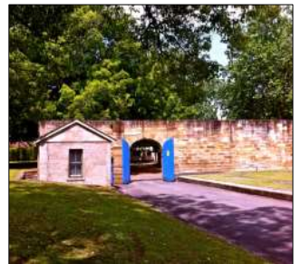
Gipps Yard Gates entrance to the Friends' Rooms