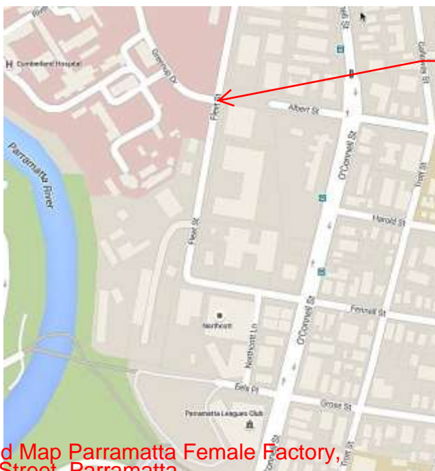
Enlarged Map Parramatta Female Factory, 5 Fleet Street, Parramatta