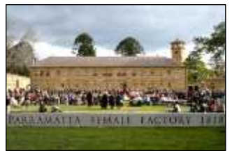
The Commemorative Wall