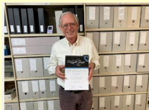
Return to Lake Innes - Port Macquarie Publication wins 2020 Mander Jones Award